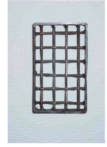
Left photograph: A batch of industrial wire screen Right photograph: A sample used in the interlaboratory comparison test